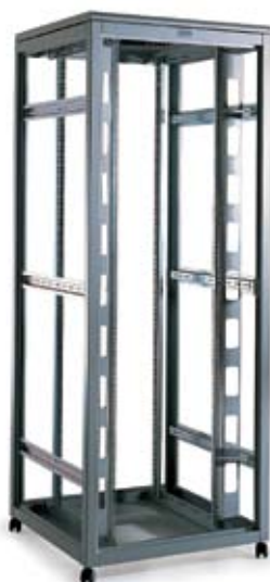
Bolted Steel Frame Chassis

A full range of door variants are available, see page 15