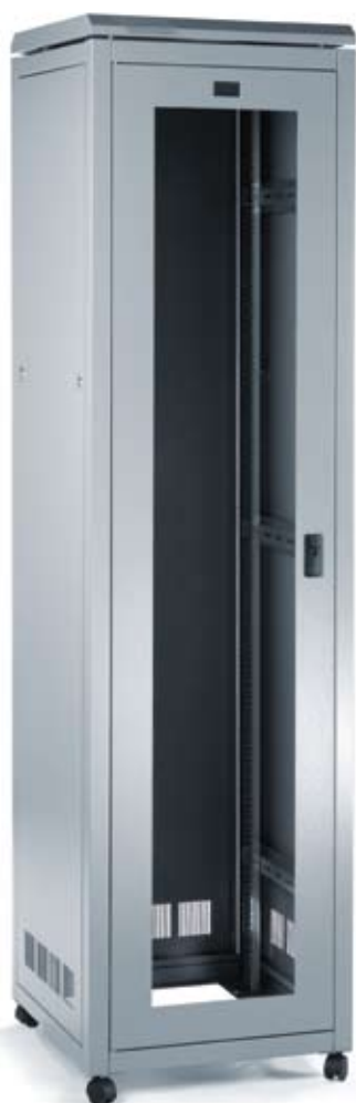
Model Shown: CAB4568