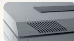
Multiple Access Points