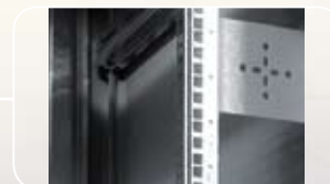
Adjustable 19" Mounting Profiles