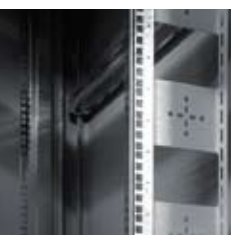
Vertical Cable Management On 800mm Wide Enclosures