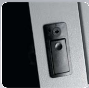
Slam Latch Locking Mechanism