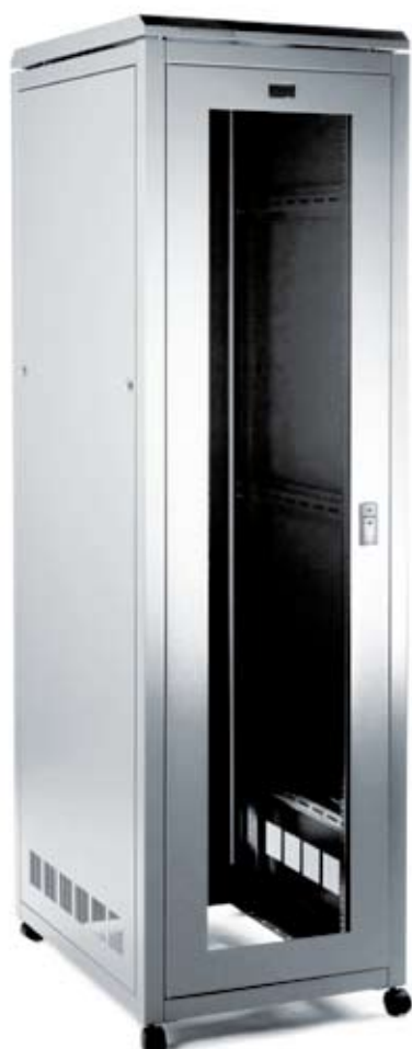
Model Shown: CAB3988