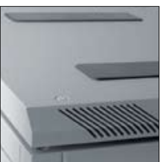
Multiple Cable Access Points Fitted

Its design has evolved from continuous development with today's installation teams.