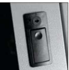
Slam Latch Locking Mechanism