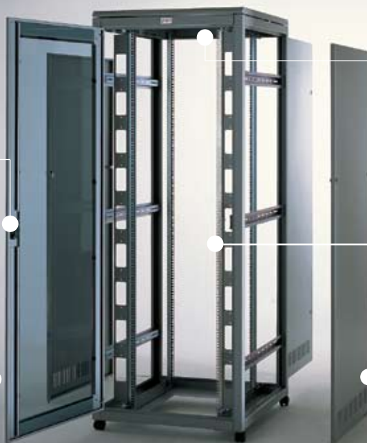
Removable Lockable Side Panels