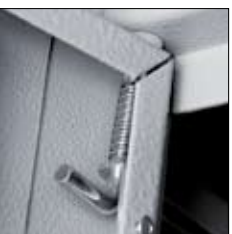
Quick Release Hinge System Provides Maximum Space During Installation